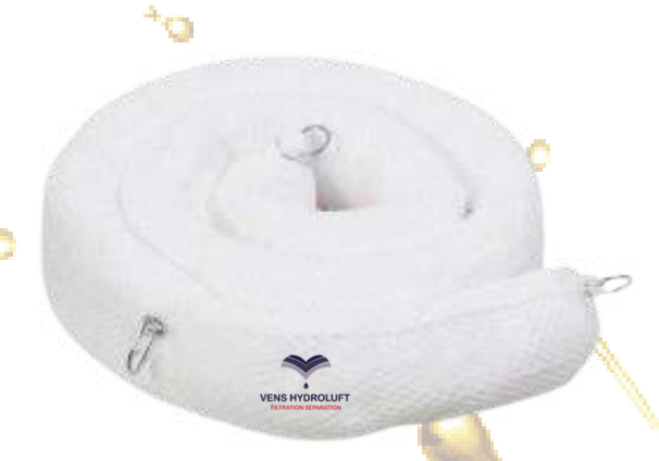
For representation. Actual Product shall vary depending on speci cation chosen

Introduction to Vens Hydroluft's SORBENT BOOM Use Sock/Net Booms to Absorb and Contain Oil: Strong mesh outer sleeve encases a poly sock skin filled with highly-sorbent poly blend. Booms won't shed or sink, even when saturated with oil. Absorbs Oily Liquids — Repels Water Poly blend filler is hydrophobic — it repels water (and floats) while only absorbing oils and other hydrocarbons. Designed for tough environment